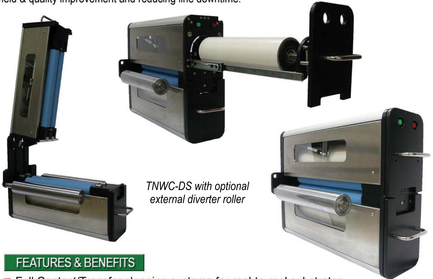
TNWC-DS with optional external diverter roller

The TNWC-SS/DS model line is a range of single or double-sided narrow web cleaners available in a variety of cleaning widths. High performance, moulded elastomer cleaning rollers remove particulate contamination down to sub micron levels from the web and transfers it to pre-sheated adhesive rolls (Patent Pending) for later removal from the work area. Standard features include clam shell opening for web threading and maintenance access, telescopic slides for side access to both adhesive rolls & passive static elimination at exit side. The TNWC-SS/DS ensures optimum cleaning performance for yield & quality improvement and reducing line downtime.